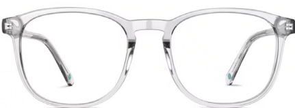
4448923 Price: $35.95 Size: Large Color: Clear Measurements: 133 - 21 - 145 Pupillary Distance (PD): 61-75mm Prescription Range: -20.00 ~ +12.00