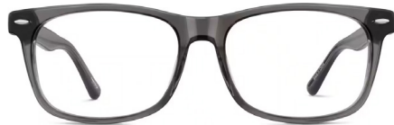
4447212 Price: $19.95 Size: Large Color: Gray Measurements: 139 - 18 - 148 Pupillary Distance (PD): 65-76mm Prescription Range: -20.00 ~ +12.00