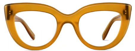
4445615 Measurements: 127 - 25 - 146 Price: $35.95 Pupillary Distance (PD): 62-77mm Size: Medium Prescription Range: -20.00 ~ +12.00 Color: Brown