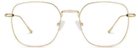
3234014 Price: $29.95 Size: Medium Color: Gold Measurements: 130 - 20 - 142 Pupillary Distance (PD): 59-75mm Prescription Range: -20.00 ~ +12.00