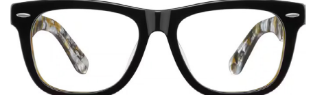
445521 Price: $29.95 Size: Medium Color: Black Measurements: 129 - 18 - 151 Pupillary Distance (PD): 58-73mm Prescription Range: -20.00 ~ +12.00