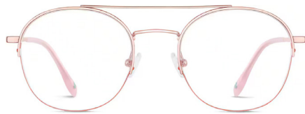
139919 Measurements: 131 - 21 - 145 Price: $49.95 Pupillary Distance (PD): 56-75mm Size: Medium Prescription Range: -15.00 - +4.00 Color: Rose Gold