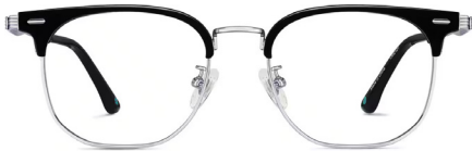
1302121 Measurements: 142 - 20 - 145 Price: $45.95 Pupillary Distance (PD): 58-74mm Size: Extra Large Prescription Range: -8.00 ~ +12.00 Color: Black