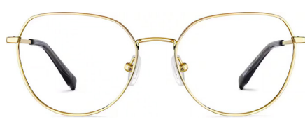
3239714 Measurements: 130 - 17 - 140 Price: $27.95 Pupillary Distance (PD): 59-73mm Size: Medium Prescription Range: -20.00 - +12.00 Color: Gold