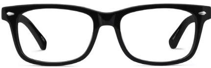
612921 Price: $25.95 Size: Medium Color: Black Measurements: 126 - 18 - 143 Pupillary Distance (PD): 54-71mm Prescription Range: -20.00 ~ +12.00