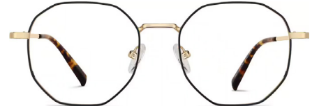
3237714 Measurements: 130 - 19 - 145 Price: $29.95 Pupillary Distance (PD): 54-71mm Size: Medium Prescription Range: -20.00 - +12.00 Color: Gold