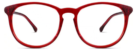
101218 Measurements: 119 - 18 - 139 Price: $25.95 Pupillary Distance (PD): 56-70mm Size: Small Prescription Range: -20.00 - +12.00 Color: Red