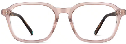
4446633 Measurements: 132 - 19 - 144 Price: $35.95 Pupillary Distance (PD): 59-73mm Size: Medium Prescription Range: -20.00 - +12.00 Color: Cream