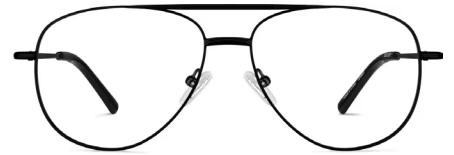
3239221 Measurements: 139 - 16 - 145 Price: $9.95 Pupillary Distance (PD): 63-75mm Size: Large Prescription Range: -20.00 ~ +4.00 Color: Black