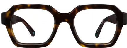
4452325 Measurements: 132 - 23 - 143 Price: $35.95 Pupillary Distance (PD): 55-74mm Size: Medium Prescription Range: -20.00 ~ +12.00 Color: Tortoiseshell