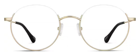
157814 Measurements: 132 - 21 - 145 Price: $19.95 Pupillary Distance (PD): 54-74mm Size: Medium Prescription Range: -5.00 - +5.00 Color: Gold