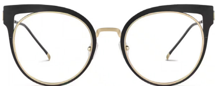
327521 Measurements: 135 - 23 - 142 Price: $29.95 Pupillary Distance (PD): 60-77mm Size: Large Prescription Range: -8.00 - +3.00 Color: Black