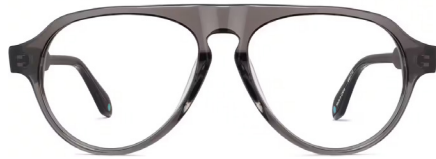
4461712 Price: $39.95 Size: Large Color: Gray Measurements: 136 - 17 - 145 Pupillary Distance (PD): 60-74mm Prescription Range: -20.00 ~ +12.00