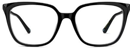
4461521 Measurements: 125 - 19 - 145 Price: $55.95 Pupillary Distance (PD): 63-75mm Size: Small Prescription Range: -20.00 - +12.00 Color: Black