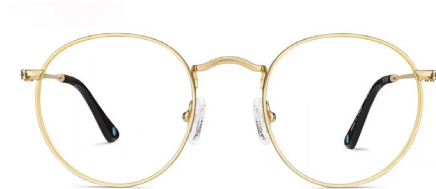
3238814 Measurements: 127 - 21 - 144 Price: $39.95 Pupillary Distance (PD): 56-73mm Size: Medium Prescription Range: -4.00 ~ +4.00 Color: Gold