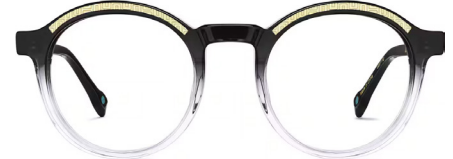
4461112 Price: $52.95 Size: Small Color: Black, Clear Measurements: 125 - 21 - 140 Pupillary Distance (PD): 73-54mm Prescription Range: -20.00 ~ +12.00