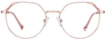
159919 Measurements: 134 - 19 - 143 Price: $25.95 Pupillary Distance (PD): 57-73mm Size: Large Prescription Range: -20.00 - +12.00 Color: Rose Gold