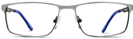
327112 Measurements: 133 - 17 - 138 Price: $25.95 Pupillary Distance (PD): 60-74mm Size: Large Prescription Range: -20.00 ~ +12.00 Color: Gray