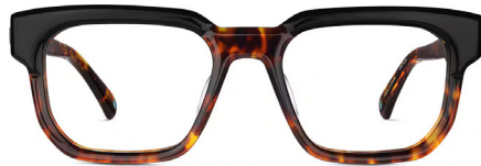
4461625 Price: $55.95 Size: Medium Color: Tortoiseshell Measurements: 132 - 21 - 145 Pupillary Distance (PD): 58-75mm Prescription Range: -20.00 ~ +12.00