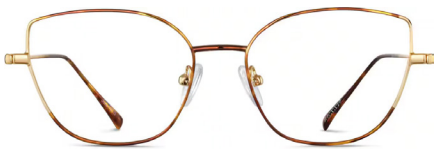
3227515 Measurements: 135 - 18 - 144 Price: $32.95 Pupillary Distance (PD): 65-74mm Size: Large Prescription Range: -20.00 - +12.00 Color: Brown