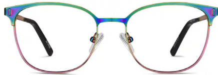
3213429 Measurements: 126 - 18 - 135 Price: $29.95 Pupillary Distance (PD): 55-71mm Size: Medium Prescription Range: -20.00 - +12.00 Color: Multicolor