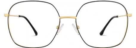
3218621 Measurements: 135 - 17 - 146 Price: $23.95 Pupillary Distance (PD): 65-75mm Size: Large Prescription Range: -8.00 - +8.00 Color: Black