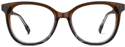
4464415 Measurements: 125 - 17 - 142 Price: $35.95 Pupillary Distance (PD): 54-71mm Size: Small Prescription Range: -20.00 - +12.00 Color: Brown