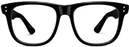
638821 Price: $29.95 Size: Large Color: Black Measurements: 136 - 20 - 148 Pupillary Distance (PD): 63-76mm Prescription Range: -20.00 ~ +12.00