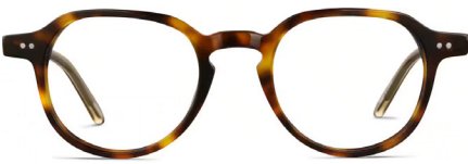
4430925 Price: $29.95 Size: Medium Color: Tortoiseshell Measurements: 126 - 21 - 145 Pupillary Distance (PD): 47-69mm Prescription Range: -20.00 ~ +12.00