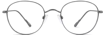
137912 Measurements: 125 - 21 - 142 Price: $45.95 Pupillary Distance (PD): 52-71mm Size: Small Prescription Range: -5.00 ~ +5.00 Color: Gray