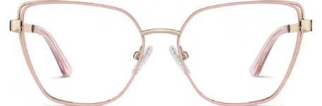
3228419 Measurements: 126 - 16 - 140 Price: $35.95 Pupillary Distance (PD): 63-71mm Size: Medium Prescription Range: -20.00 - +12.00 Color: Pink