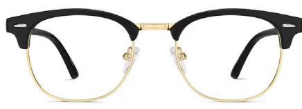
195421 Price: $15.95 Size: Medium Color: Black Measurements: 132 - 23 - 146 Pupillary Distance (PD): 59-77mm Prescription Range: -20.00 ~ +12.00