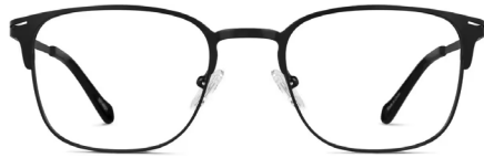
3214821 Measurements: 127 - 21 - 140 Price: $25.95 Pupillary Distance (PD): 56-73mm Size: Medium Prescription Range: -20.00 ~ +12.00 Color: Black