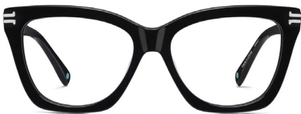
4456021 Measurements: 125 - 17 - 146 Price: $35.95 Pupillary Distance (PD): 57-71mm Size: Small Prescription Range: -20.00 ~ +12.00 Color: Black