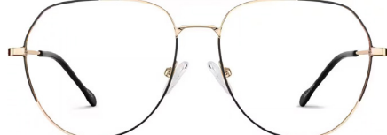
3223621 Measurements: 133 - 16 - 143 Price: $29.95 Pupillary Distance (PD): 59-72mm Size: Large Prescription Range: -20.00 - +12.00 Color: Black