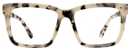
4446535 Measurements: 130 - 18 - 138 Price: $35.95 Pupillary Distance (PD): 62-73mm Size: Medium Prescription Range: -20.00 ~ +12.00 Color: Pattern