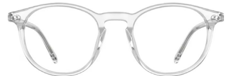
4422423 Price: $25.95 Size: Small Color: Clear Measurements: 124 - 22 - 139 Pupillary Distance (PD): 51-72mm Prescription Range: -20.00 ~ +12.00