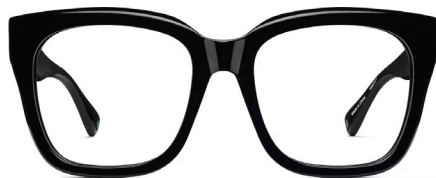
4462421 Measurements: 131 - 19 - 145 Price: $39.95 Pupillary Distance (PD): 64-76mm Size: Medium Prescription Range: -20.00 ~ +12.00 Color: Black